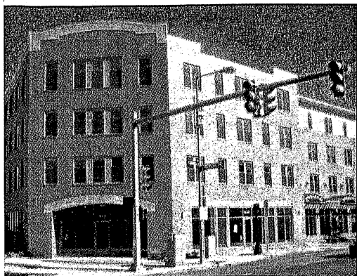
with housing and retail space on the grounds of a former church campus.

garage that worked into the layout of the other new structures.